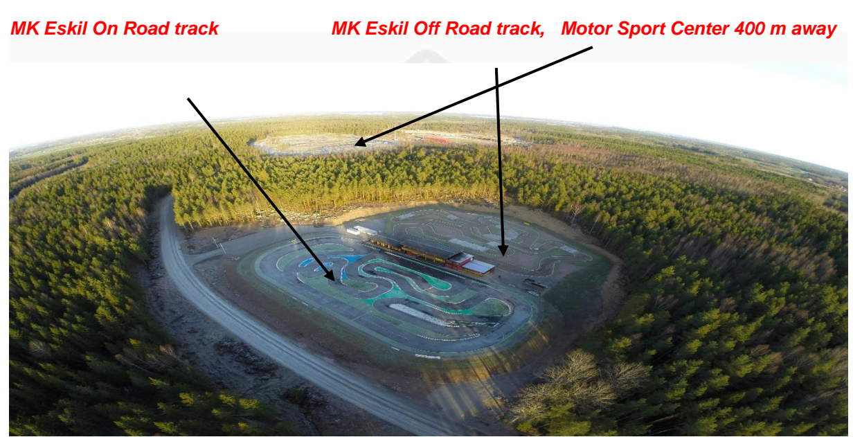
For more information regarding the facility and the EC event go to. Link